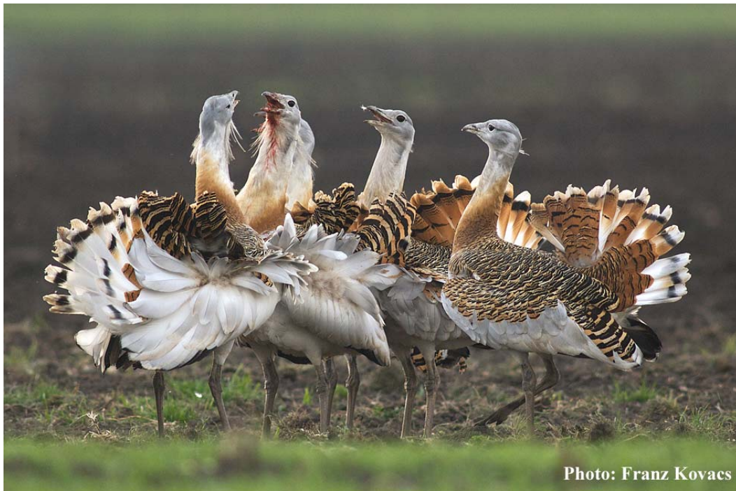
Figure 7: Adult males are fighting in spring. From this point of view the male in the right seems younger likely than the others, ranked to the second or the third age class.

much more brilliant than in neck category 1. The neck base is also bulkier due to the longer, hanging breast feathers, which according to Gewalt (1959) grow after the partial moult in winter to more than double their length of the non-breeding season. This provides the necks of adult males with their typical massive, powerful appearance.