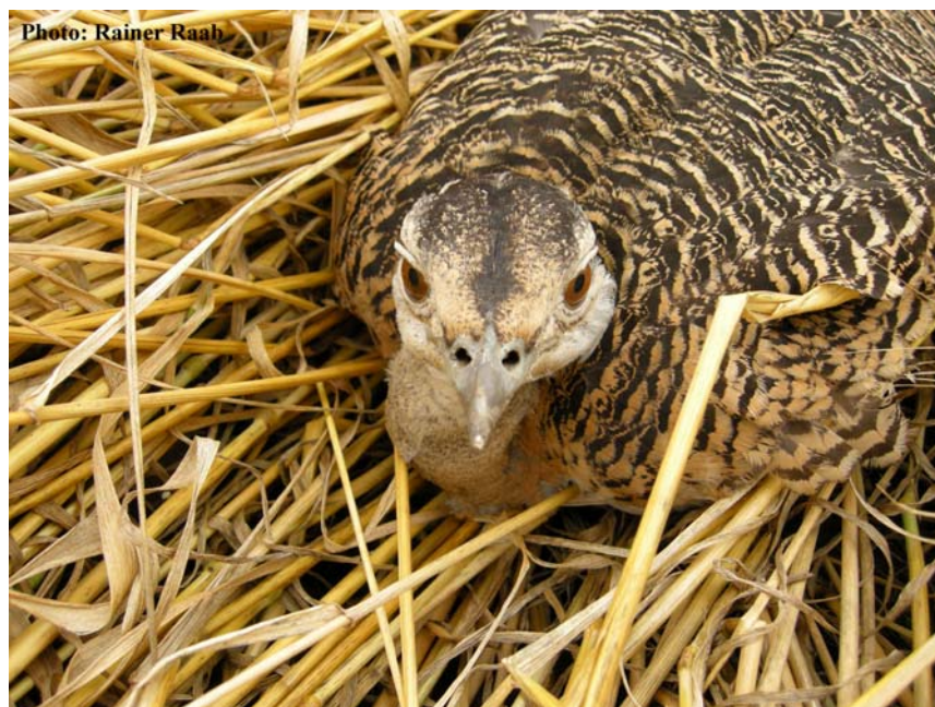
Figure 3: A squat chick which would be able to fly due to its development.