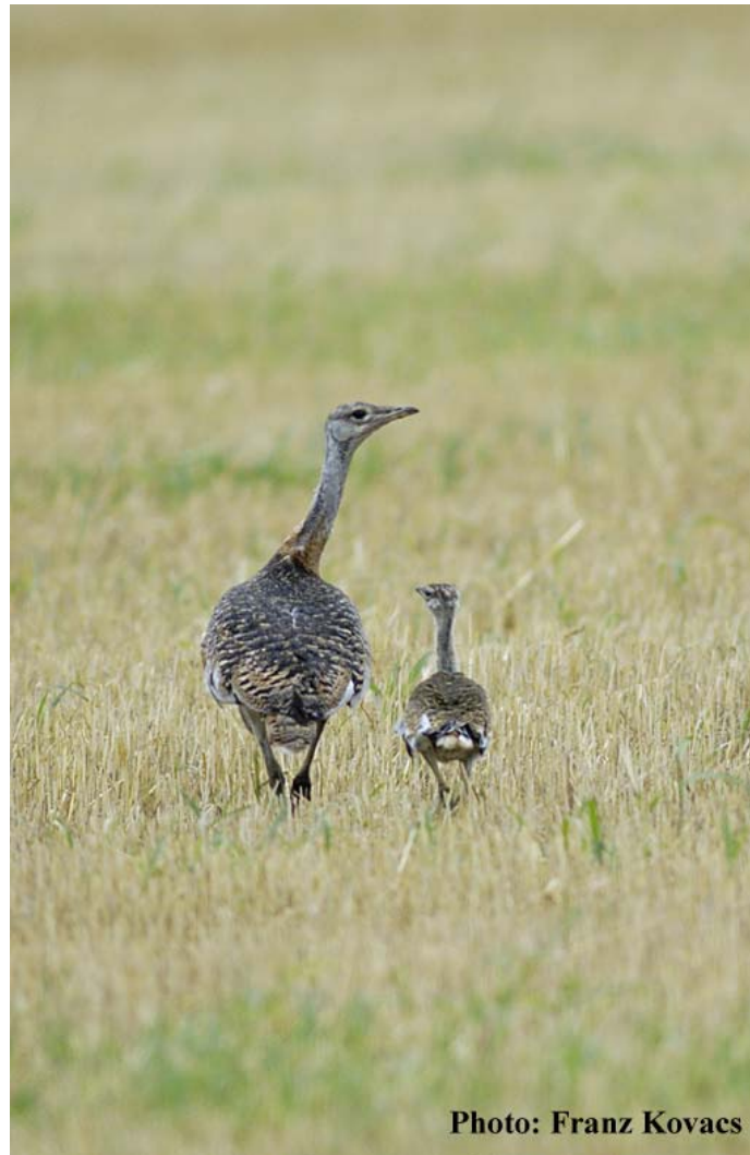
Figure 2: A female Great Bustard with her juvenile.