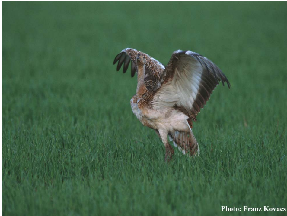
Figure 4: This juvenile Great Bustard has just reached the ability for fly.

Till this point of time quite easy to determine the age of a Great Bustard chick, but because of the usual hiding behaviour of them, generally most of the chicks grow up „invisibly”, thus the occasional observations are not enough to draw a conclusion about the whole population.