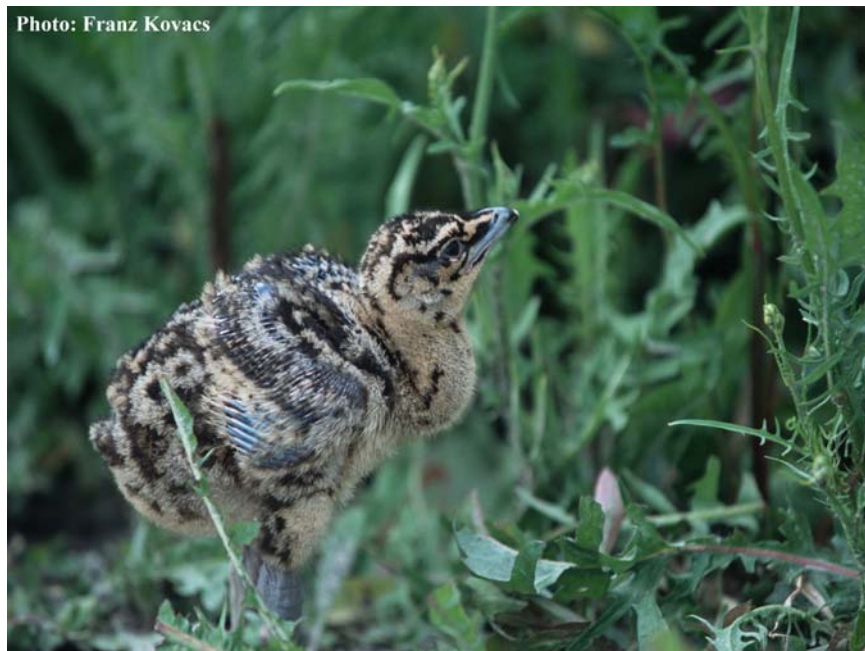
Figure 1: A circa one week old Great Bustard chick.

It is possible to deduce the age of the chicks from the state of their development. At the age of 1 week (figure 1), their primary feathers begin to grow, at the age of 2-3 weeks (figure 2), the tail and the body feathers are growing faster respectively, and as they are 1 month old, the first moult has nearly finished. The young Great Bustards reach the ability to fly, when they are 5-6 weeks old, although they rather squat in danger then fly in this time (figure 3). From this time their growth is roughly constant until they reach the size of their mother in generally September. Since this time to distinguish the juvenile from an adult undoubtedly is difficult in field, except the juvenile male, because they grow further, their size will bigger, their neck will broader usually in October compared to the females (Gewalt, 1959, Cramp & Simmons 1980).